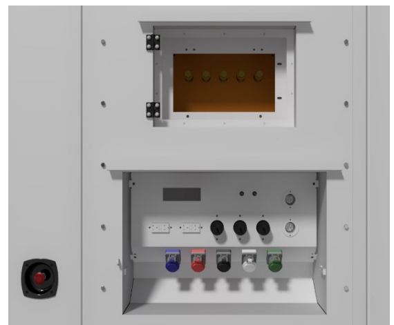
Distribution panel (side)