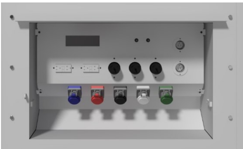
Connection Cam-Lock Standard