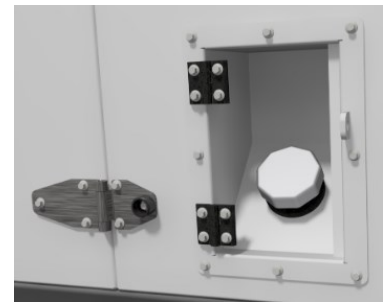
Lockable external fuel fill